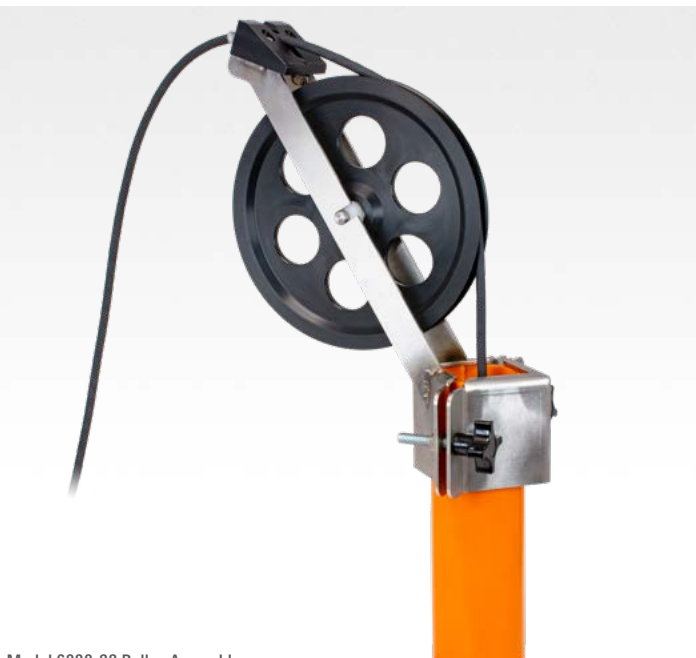
Model 6000-22 Pulley Assembly.