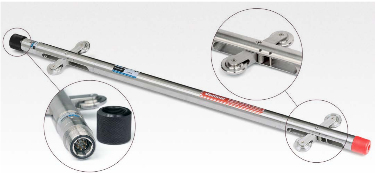
Model 6105 Digital Inclinometer Probe.