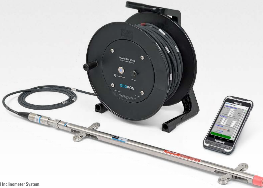
Model GK-604D Digital Incliner System.