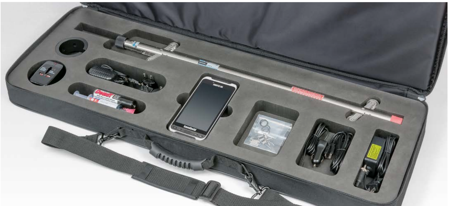
Model 6000-17 Cordura® Carry Case, with padded interior, is used to protect the probe, FPC-3 Field PC and accessories from shock during transportation. Case contents (top; left to right): Inclinometer Probe, Universal Power Adapter, Wall Charger for the Field PC, Deoxit Spray and Waterproof Grease, Field PC, Spare Parts for the Inclinometer Probe, Car Charger and USB cable for the Field PC, Cable Reel Charger.